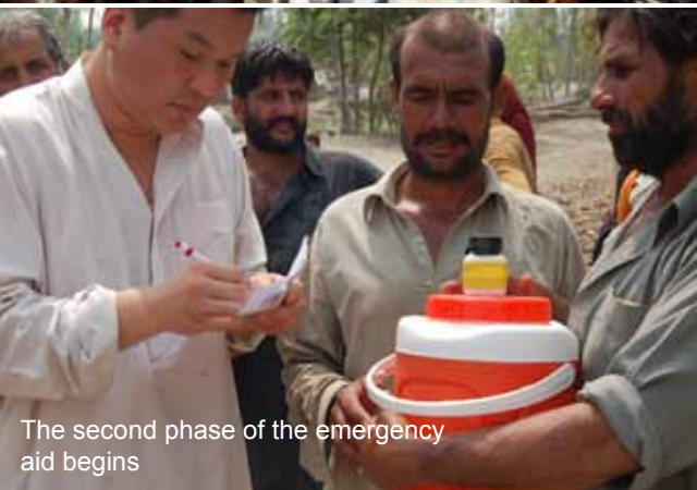
The second phase of the emergency aid begins