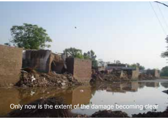
Only now is the extent of the damage becoming clear

A few hundred meters further on, a man waved us down and said